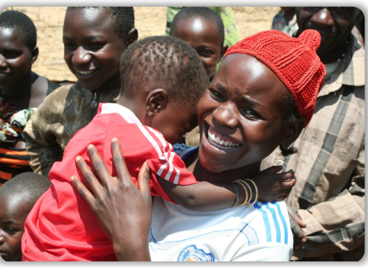
Mothers, babies, and all villagers thrive with access to clean water

This Mother's Day, we invite you to consider a donation in honor of the important mothers in your life. Your gift will help TLP get clean water to more villages, preventing illness and aiding mothers as they bring life into the world.